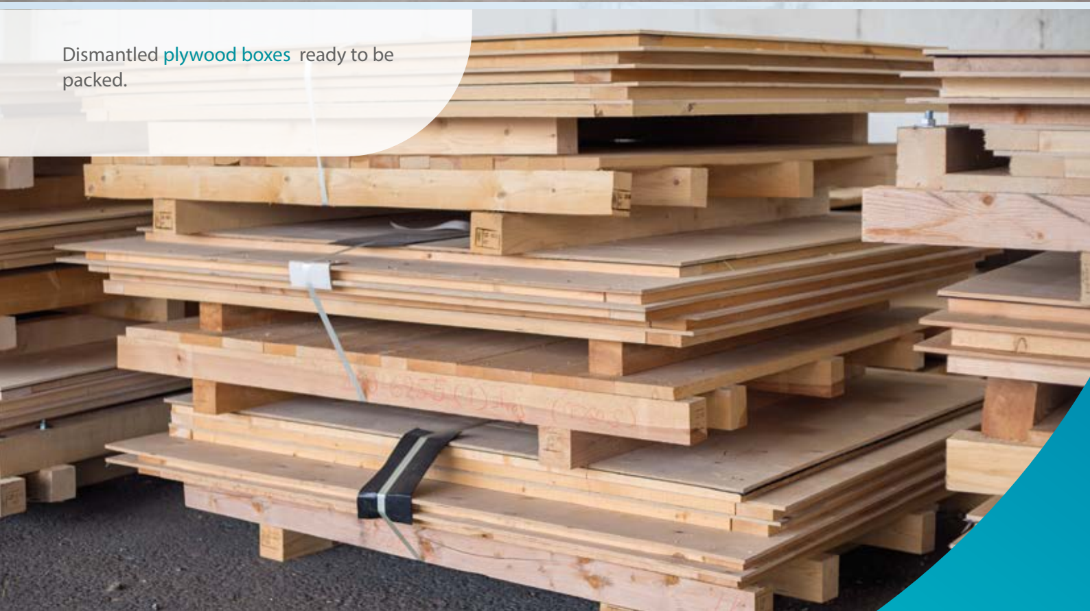
Dismantled plywood boxes ready to be packed.