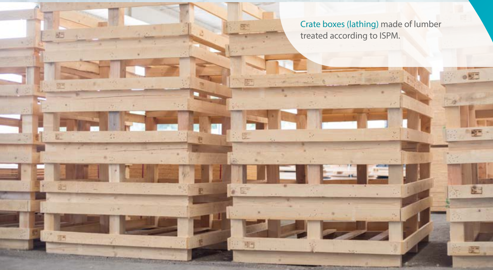
Crate boxes (lathing) made of lumber treated according to ISPM.